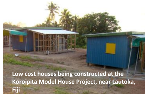
Low cost houses being constructed at the Koroipita Model House Project, near Lautoka, Fiji

Over the course of the Koroipita Model Town Project to date, more than 200 Tasmanian Rotarians have volunteered their time to work on the project, with many more teams of Rotarians from Tasmania to come. One of the thoroughfares in Stage 1 is called Tasmania Street in recognition of the contributions of the Tasmanian Rotarians who have worked on the project.